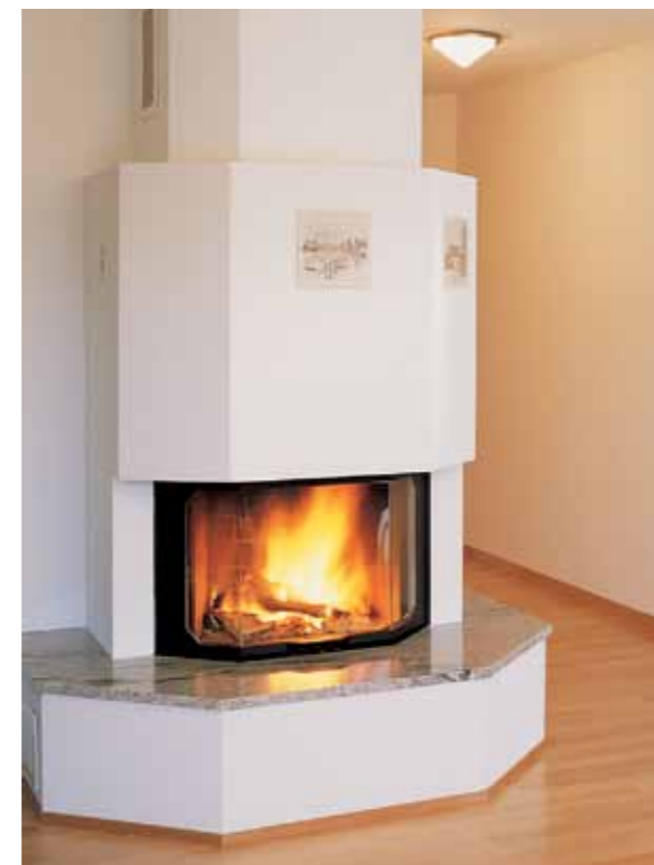
PRISMA / PRISMALO